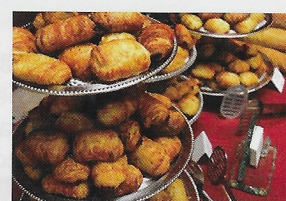
ViVA 2018 featured a French-themed cuisine catered by Blue Water Bay.